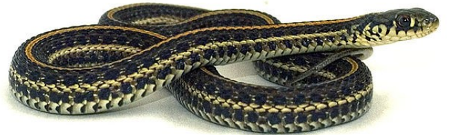
Plains Gartersnake.