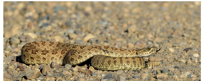
A Prairie rattlesnake.

Keeping gartersnakes as pets in Alberta is illegal unless you acquire the proper permit.